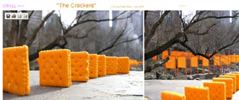
"The Gates" Persiflage in the InterNet: "The Crackers"

In view of all the orange scarves and caps in New Yorker streetscapes, one could believe as blameless observers, the Bhagwan Shree Rajneesh had furnished a Ashram for its cult in the cent ral park.