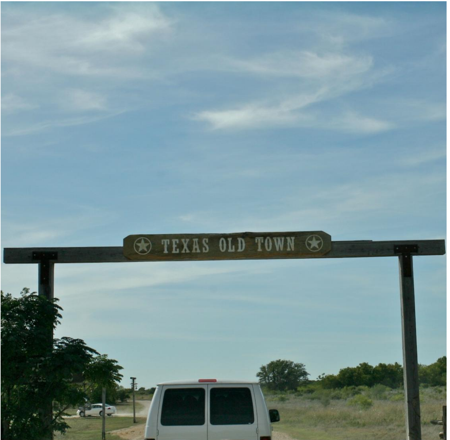
O is for Obama in '08 and Old Town.